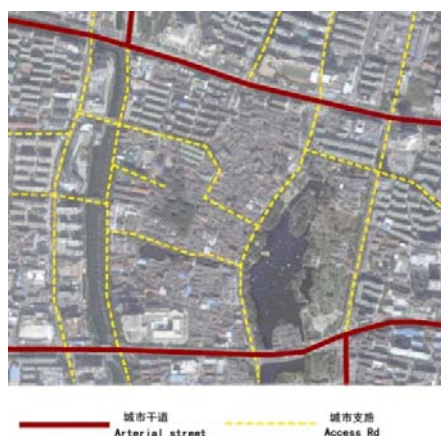
Fig. 6 The external traffic of Tianyi Pavilion Historic District