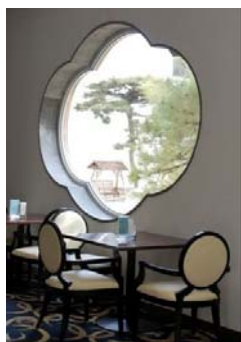
Fig. 1 The corresponding view of Fragrant Hill Hotel window

context of Yue River, gardens of Jiangnan region with traditional structures, so it is very famous and has a significant value for history and culture.