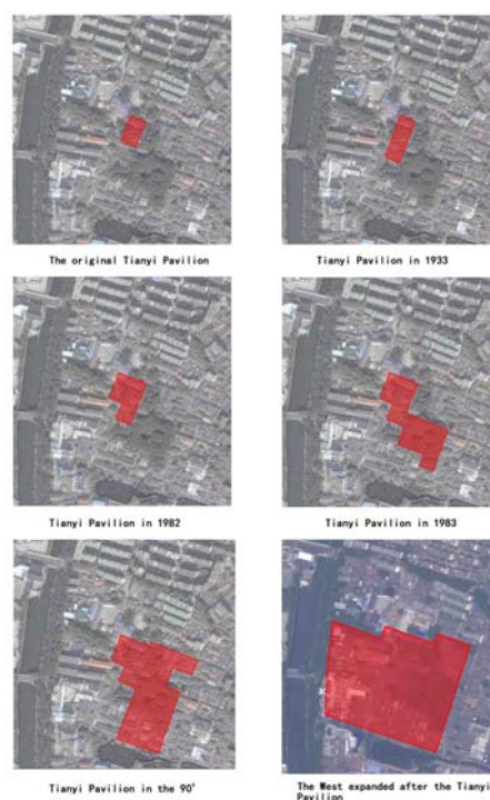
Fig. 4 Spatial change in Tianyi Pavilion

Affairs in feudal China of Ming Dynasty, Wen Yuan's "Tiangong Parterre" has been incorporated into Tianyi Pavilion and it was converted into "East Garden" which was managed as a part of garden; V. From 1989 the ancestral halls alongside the roads including Qin clan hall, Wen clan hall, Chen clan hall and some factory buildings have been incorporated into Tianyi Pavilion as a showcase part for traditional culture. From then on the area of Tianyi Pavilion has reached to the climax including main body of pavilion (library), gardens (garden regarded as a leisure area) and traditional buildings (showcase area for history culture). So with the development of functions of Tianyi Pavilion, the concept of Tianyi Pavilion has experienced a transformation from small to a large one (see Fig. 4). Meanwhile there are two concepts for Tianyi Pavilion, one is narrow definition the other is a broad one. The narrow definition of Tianyi Pavilion refers to the main body of library of Tianyi Pavilion, while from the perspective of preservation of integration of Tianyi Pavilion, the board definition of Tianyi Pavilion includes a area which covers from westward part of west wall of Tianyi Pavilion to the Changchun Road and the southward part of Tianyi Street and 2.5 hectares land of northward part of Maya Street (see Fig. 5).