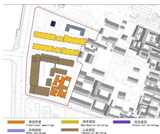
Fig. 7 The Schematic diagram of Tianyi Pavilion historic district building function