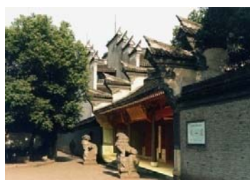
Fig. 3 The entrance to Tianyi Pavilion