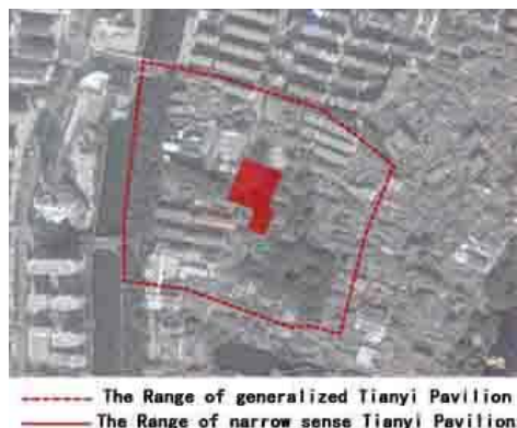
Fig. 5 The historic district planning area of Tianyi Pavilion

Road, Yanyue Street and Zhenming Road. The northern part of Tianyi Pavilion was a part of Fan clan residential area, now the whole area of traditional structure of street and alley has gone. Right now the surroundings of Tianyi Pavilion are filled with five functionality (see Fig. 7) architectures including Historical buildings, traditional residential houses, industrial buildings and residential houses which were built over the past forty years (see Table II).