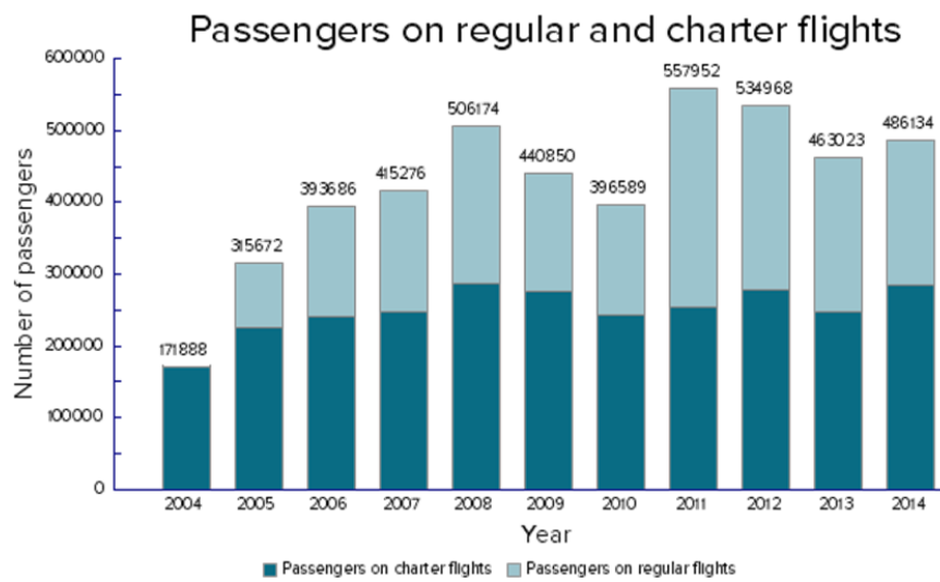
Fig. 1 Passengers on regular and charter flights [6]