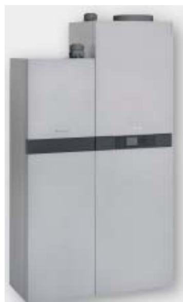
Fig. 3 Vitovalor 300-P is 0.75 kW CHP System

Vitovalor 300-P is 0.75 kW PEMFC based fuel cell CHP system which is integrated with integral gas condensing boiler for peak load as shown in Fig. 3. Cost of installation of this system is reported as £22000. Average expected return on this investment is £1000/annum [8]. Electrical efficiency of the fuel cell module is reported as 37% and overall efficiency is 90%. It delivers a maximum of 19 kW of heat output and produces 15 kWh of daily electricity. Internal boiler will start automatically when the heat demand goes above the heat produced by the fuel cell i.e. in the peak time. Vitovalor 300-P also comes with an App (mobile application) to remotely control the CHP operations including to change room temperature, control program timers, start and stop, etc. [8]