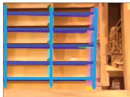
Fig. 3 Laths on the upper shell panel of aircraft

In the present system, the DMU superimposed to the real part of aircraft panel. Benefiting from the laths on the upper shell part, recognition of the product is provided (Fig. 3).