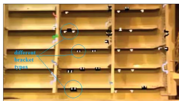
Fig. 4 Located brackets on the screen

Following, brackets are displayed on the screen where should be located on.