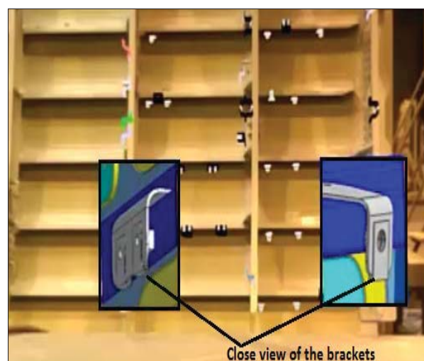
Fig. 5 Located brackets on the screen

By touching the desired part of the touch screen, actual state of the image can be seen clearly (Fig. 5). In this project, one workstation PC, a camera and Metaio software is used. Established image transferred to the computer with a fixed camera system and presented to the user.