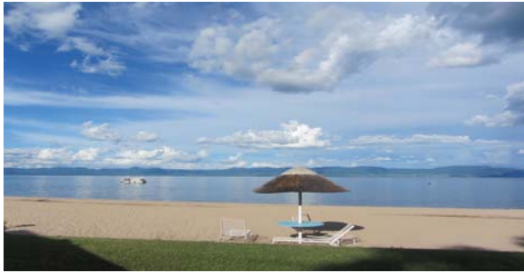
Fig. 1 Lake Malawi (Sunbird Nkopola Lodge, Author’s photo, March 2013)

potential to attract international visitors in their own right.”