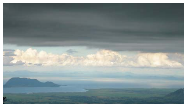
Fig. 2 Lake Chilwa (Author’s photo April 2007)

Five of the ten entrepreneurs value advice from individuals with prior experience of entrepreneurship. This correlates with literature [29] regarding the importance of individuals with entrepreneurial experience in venture creation and opportunities. In fact, in one of the cases studied, parents with prior experience of entrepreneurship were identified, supporting Carr and Sequira’s [30] research on family entrepreneurship.