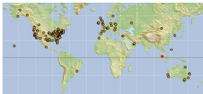
Fig. 2 AR Sandboxes around the world and Singapore (in red).

AR Sandboxes has been developed and used and their numbers have exceeded 150 globally (Fig. 2). The most recent one was built in Singapore, at the Department of Geography, National University of Singapore (NUS) to support modern approach to geoscience education.