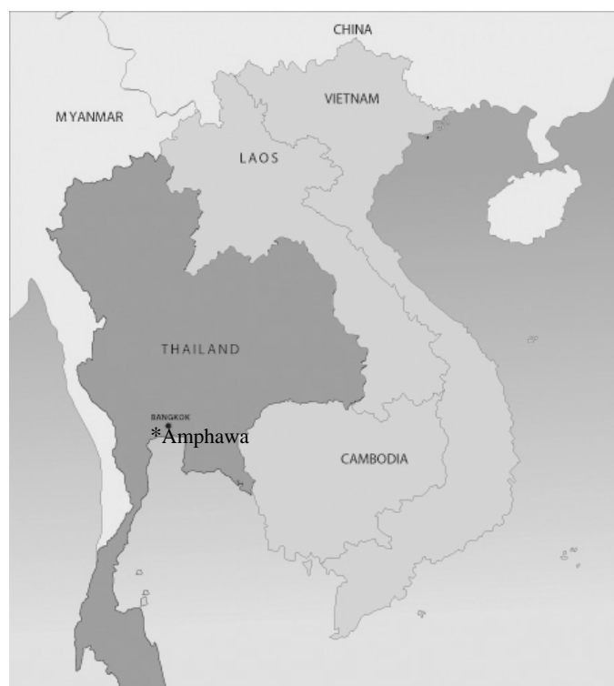
Fig. 1 Location of Amphawa, Samut Songkram

The mass tourists at Amphawa floating market can generate income to local people however tons of waste and wastewater have been generated by tourists, respectively. Light from the expansion of the municipal area, resorts, and tourism activities also affect mating behavior of fireflies. In addition, water consumption of tourists during weekend also creates water shortage in Amphawa.