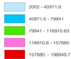
Fig. 2 Map of Water Consumption Demand of Tourist Accommodation in Amphawa

Range of Water Consumption Demand (Meters 3 /Month)