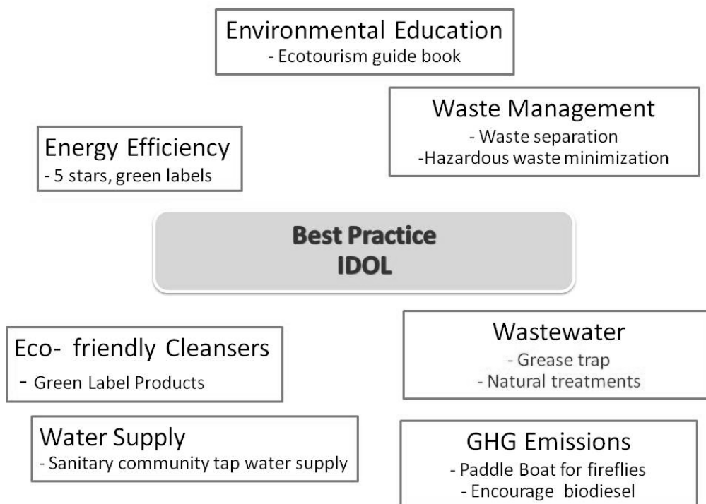
Fig. 3 Best Practice of Environmental Management for Tourist Accommodation.

Last but not least, environmental education in terms of develop ecotourism guide books are also essence to raise tourist's environmental awareness.