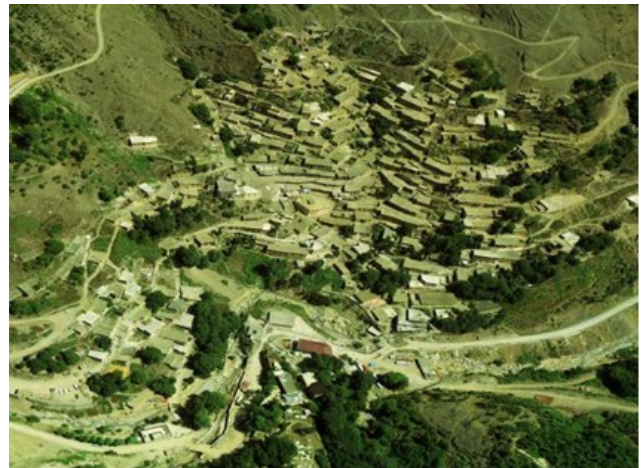
Fig. 2 Aerial photograph of Masouleh

Masouleh is a Beautiful village near the Alborz mountain range with peculiar architecture of its own. Spread over 100 hectares, Masouleh is located at the southern end of the humid Caspian Sea in a river valley. This city is 1050 meters above sea-level. Because of the beauty of nature and unique traditional architecture of Masouleh, the village was registered as a national monument in 1975 with the number of 1090 (Fig. 2) [14].