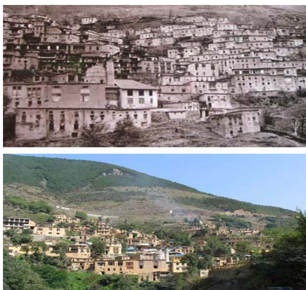
Fig. 15 Old Masouleh and new Masouleh

Historic village of Masouleh is the first Iranian city which has been completely registered in list of Iran's National Heritage sites. Despite all the problems, cultural heritage experts are making huge effort to prepare the suitable ground for its world registration.