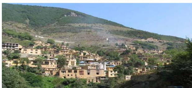
Fig. 15 Old Masouleh and new Masouleh