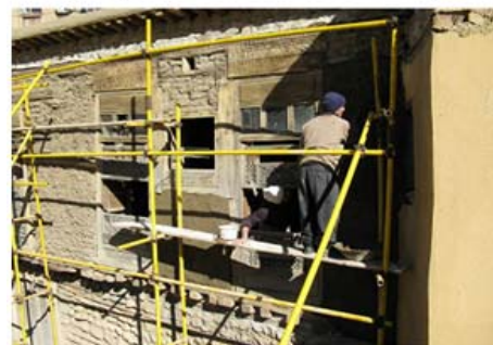
Fig. 9 Ingredients of wall in Masouleh houses