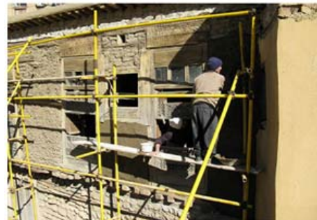
Fig. 9 Ingredients of wall in Masouleh houses