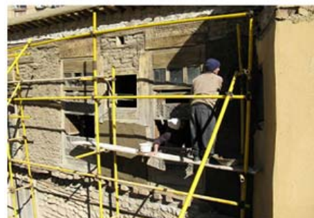
Fig. 9 Ingredients of wall in Masouleh houses