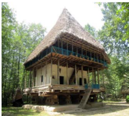
Fig. 1 The sample of height expansion houses in Gilan