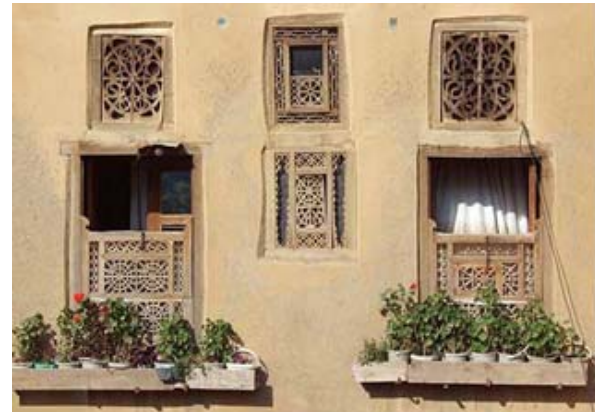
Fig. 13 The sample of Window in Masouleh houses

aesthetic role and craftsmen use the geometric and especially circle motif for establishment [18] (Fig. 13).