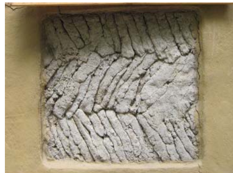
Fig. 10 Adobe and stones were provided walls

Horizontal beams (Oak wood) were installed on the cradles of the walls, also some other beams which called Kalile put in as parallel as the horizontal beams to make roof; Kalile was distribute the stress. As a next step, timbers (Beech wood) were connected to the beams in each 20 or 30 centimeters. Then the crevices among the timber of floor were covered with cob, wild fern and Fal-gel with 8%-10% slope; wild ferns grow abundantly in Masouleh and acting as an insulator