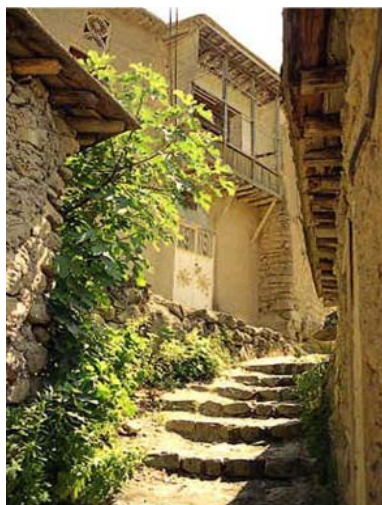
Fig. 3 Access routes and alleys in Masouleh

also would not make it possible for vehicle to enter (Fig. 3).