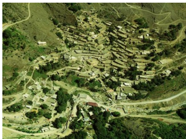
Fig. 2 Aerial photograph of Masouleh

Masouleh is a Beautiful village near the Alborz mountain range with peculiar architecture of its own. Spread over 100 hectares, Masouleh is located at the southern end of the humid Caspian Sea in a river valley. This city is 1050 meters above sea-level. Because of the beauty of nature and unique traditional architecture of Masouleh, the village was registered as a national monument in 1975 with the number of 1090 (Fig. 2) [14].