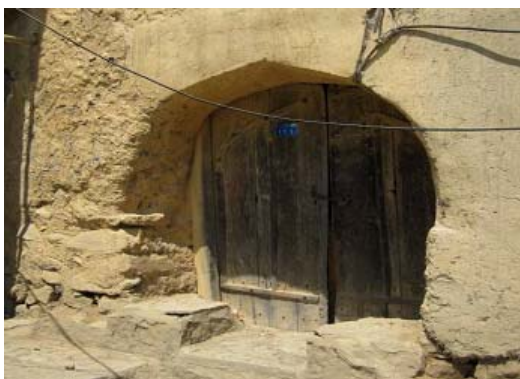
Fig. 12 The sample of door in Masouleh houses

Often tree trunks are used as elements not only for the structural use, but also for decorative components as doors and windows [10]. Doors in Masouleh houses are made in different way; the most common variety of doors in Masouleh are single-leaf doors and double-leaf doors. Standard door size in residential houses is 70 centimeter wide and 160-170 high, but the door of some houses has 170 width and 200 centimeter height for transportation of domestic animals (Fig. 12).