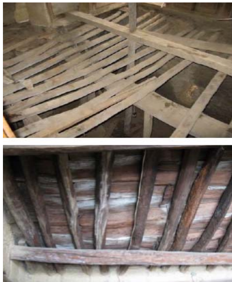
Fig. 11 The structure of roof at first until the end

against water. Also Fal- gel is a common plaster which is mixture of clay, shattered rice stalk and water; shattered rice stalk should not be longer than 10 centimeters (Fig. 11).