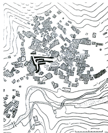
Fig. 5 The location of Bazar in Masouleh

With the expansion of Masouleh houses in south or south west, the dwellers enjoyed enough sunlight in winter and local airflow in summer.