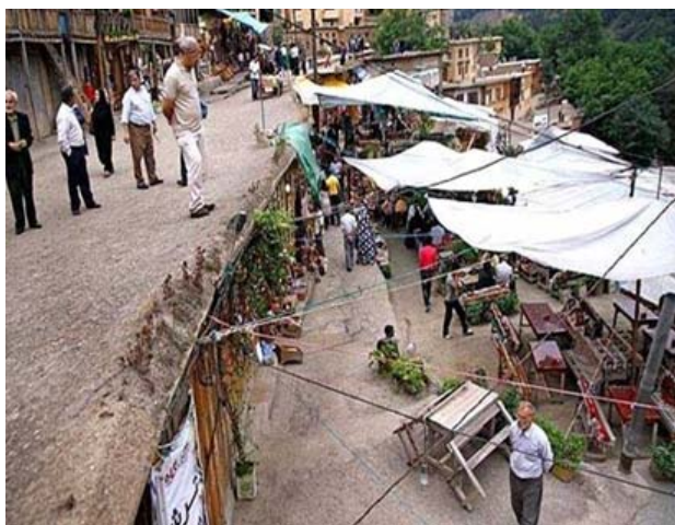
Fig. 4 The main financial part of Masouleh, Bazar

Bazar of Masouleh is seven- storey and there are 120 shops in there (Fig. 4).