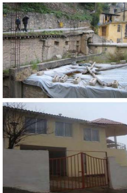
Fig. 14 New construction in staircase structure of Masouleh

The depreciation of essence and spirit of Masouleh during these 50 years is noticeable. After Manjil earthquake in 1990, 400 units of Masouleh houses were reduced to 100 residential building which 90% of these 100 houses suffered from serious destructions. Also, after 1990, 15% of traditional doors and windows were remained. In reconstruction done by the government, 250 new houses with modern technology and building materials were made during the last 10 years. In fact, the main reason of devaluation of Masouleh historical value is the use of modern technology and changing the staircase style of Masouleh structure in new construction (Fig. 14).