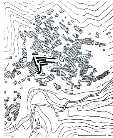
Fig. 5 The location of Bazar in Masouleh

With the expansion of Masouleh houses in south or south west, the dwellers enjoyed enough sunlight in winter and local airflow in summer.