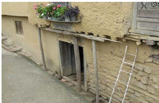
Fig. 8 Basement was made by stone

The existence of rainforest because of humid and mild climate, has led to utmost using of Local materials in vernacular architecture. Hence, wood, stones, wild ferns and adobe were used as the main sources of building in Masouleh. The foundation and basement were consist of thick lumbers and stones. The stones of foundation and basement were avoided the penetration of land moisture into the houses and absorb the warmth of sunlight during the day [8], [10], [17] (Fig.8).