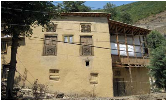
Fig. 7 The sample of Talar Ke house