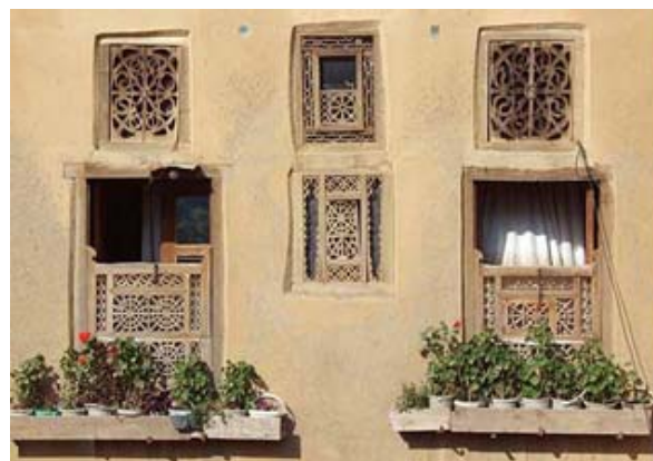
Fig. 13 The sample of Window in Masouleh houses

aesthetic role and craftsmen use the geometric and especially circle motif for establishment [18] (Fig. 13).