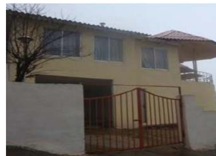
Fig. 14 New construction in staircase structure of Masouleh

On the other hand, Villagers' dwelling pattern is changing with time due to penetration of urban culture through mass media. Therefore, during last 60 years, Masouleh population