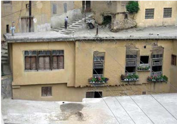
Fig. 6 The sample of Baria Ke house

Also The hall where located behind the rooms or Talar in local language is called Soumeh, which is also the family winter quarter [7].