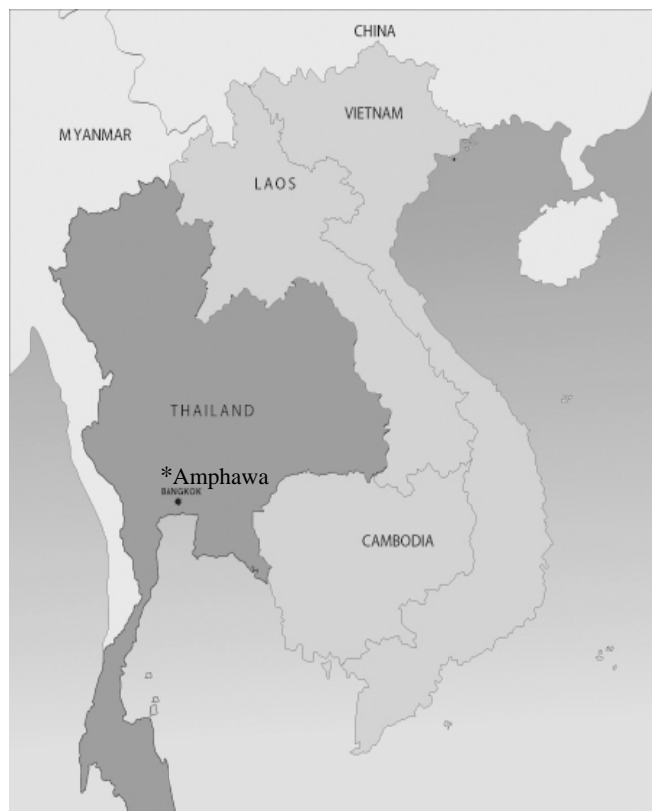
Fig. 1 Location of Amphawa, Samut Songkram

agro tourism, natural tourism, and religion and cultural tourism. Especially, in the core area of Amphawa is the critical area for firefly watching, appreciation way of life, floating markets and sightseeing along canals. Therefore, the development of tourism in Amphawa is increasing rapidly while several environmental impacts have appeared. More than 112 homestays and resorts have been developed in Amphawa (Fig. 2) [3], especially along the riverside. The mass tourists at Amphawa floating market can generate income to local people however tons of waste and wastewater have been generated by tourists, respectively. Light from the expansion of the municipal area, resorts, and tourism activities also affect mating behavior of fireflies. In addition, water consumption of tourists during weekend also creates water shortage in Amphawa as well as wastewater from tourist accommodations can also discharged through natural environment if with or without wastewater treatment system.