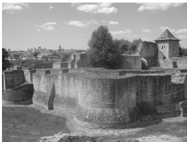
Fig. 5. Suceava. Current image of the princely fortress

Without any reappraisal of already presented arguments [41], one should fully agree to M. D. Matei's assessments of the 1384-1387 interval, as representing the period in which Moldavia's capital moved from Siret. Although the available