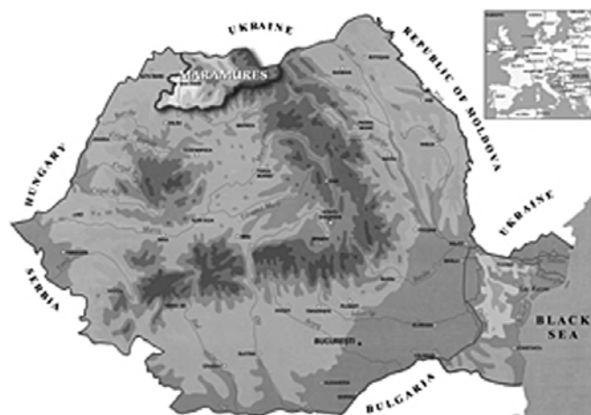
Fig. 3. Territory of Maramureş on the present map of Romania

Thus, adding this clarification to the other information provided by Ottokar's chronicle, it may be concluded that the most likely location of Otto's detention could actually be the Maramures Country (Fig. 3), possession of the Hungarian crown and also placed in the close proximity of Halicz [22].