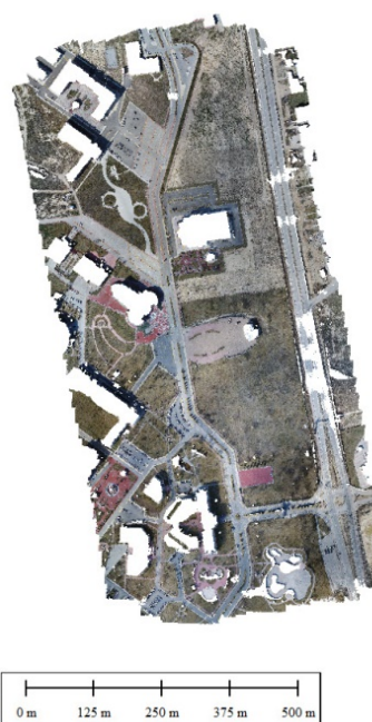
Fig. 3 Point cloud filtered by CSF (Ground point)

MEs is recorded at the centimeter level at 5% data density for random data reduction algorithm (-0.010 m). MEs are sub-centimeter at 25%, 50% and 75% data, showing that interpolation biases were negligible.