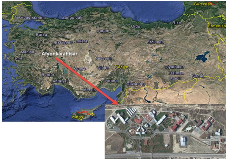
Fig. 1 The study area